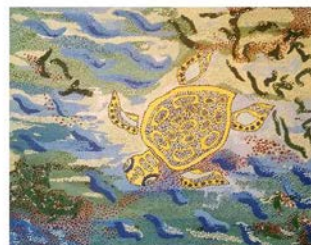
Kelp - Acrylic on Canvas - 40 x 50 cm - Diane Marlow